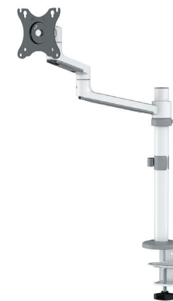
DS60-425BL1 / WH1 Screen size: 17-27" Capacity: 8 kg