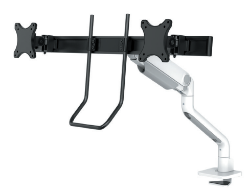
DS75S-950BL2 / WH2 Screen size: 17-27" Capacity: 8 kg (2x) Large cockpit set-up possible