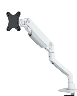
DS70S-950BL1 / WH1 Screen size: 17-49" Capacity: 18 kg (curved 15 kg) Strengthened head