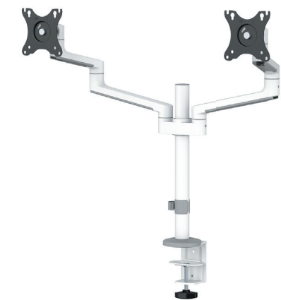
DS60-425BL2 / WH2 Screen size: 17-27" Capacity: 8 kg (2x)

Also available: DS20-425BL1 Laptop mount DS20-425BL2 Laptop/monitor mount