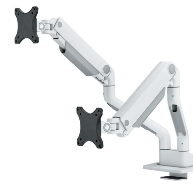
DS70S-950BL2 / WH2 Screen size: 17-35" Capacity: 18 kg (2x) Strengthened head