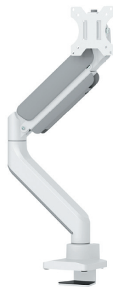
DS70PLUS-450BL1 / WH1 Screen size: 17-49" Capacity: 18 kg (curved 15 kg) Strengthened head