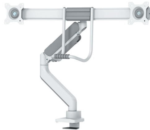
DS75-450BL2 / WH2 Screen size: 17-32" Capacity: 8 kg (2x)